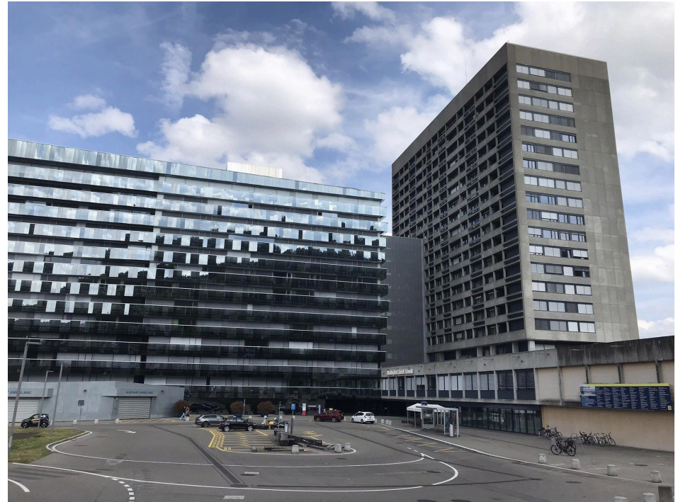
Stadtspital Zurich Triemli

During my internship, I had the opportunity not only to deepen my knowledge in interventional and diagnostic radiology but also to learn more about how the radiology department works. Upon my arrival, I was warmly welcomed and integrated into the medical team of the Zurich hospital. The staff treated me very nicely throughout my internship and were always helpful. Every doctor I met was always interested in me and tried to pass on their knowledge in the best possible way.