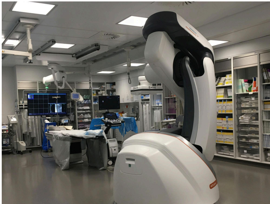
The angiosuite at Stadspital Zurich Triemli.