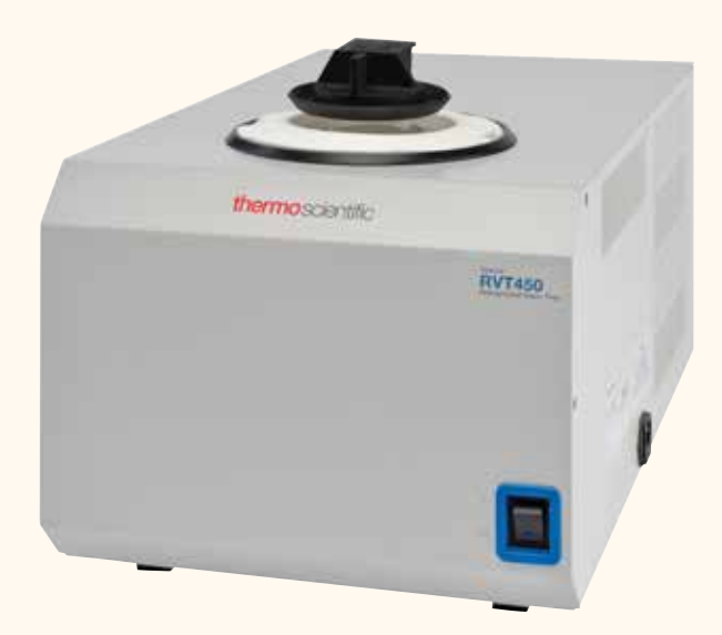
Savant RVT450 Refrigerated Vapor Trap

If you are evaporating organic solvents, check the efficiency of the cold trap. Start the run with a clean, empty GCF in the cold trap. After the run is over and the samples are dry, remove the GCF and allow the contents to thaw. Pour the solvent into a graduated cylinder and measure what has been collected. Divide that number by the total started with and multiply by 100 for the percentage of solvent trapped. It should be 85 to 95% for best operation.