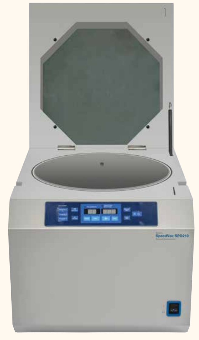
Savant SpeedVac SPD210 Vacuum Concentrator